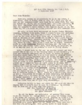
Letter from Katherine Anne Porter to John Malcolm Brinnin, September 06, 1953