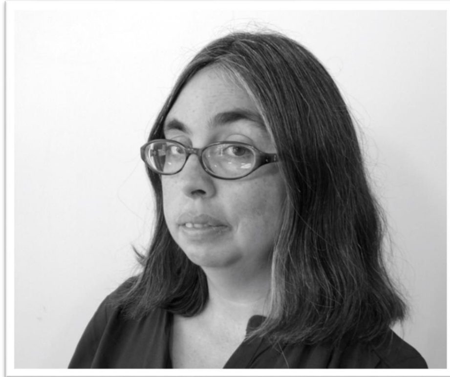
Christine Di Bella ArchivesSpace