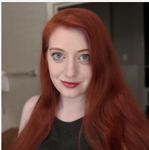
Melissa Nerino Industrial Archives & Library