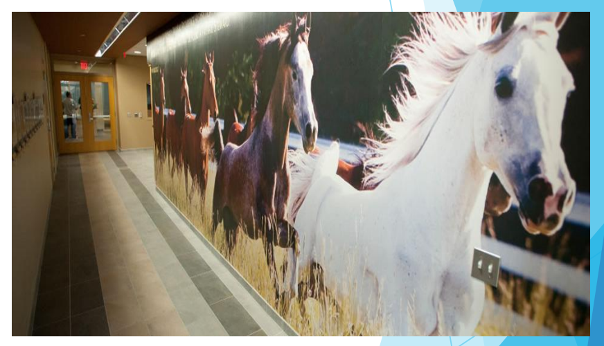
Foyer of the W.K. Kellogg Arabian Horse Library, 1<sup>st</sup> floor of the University Library