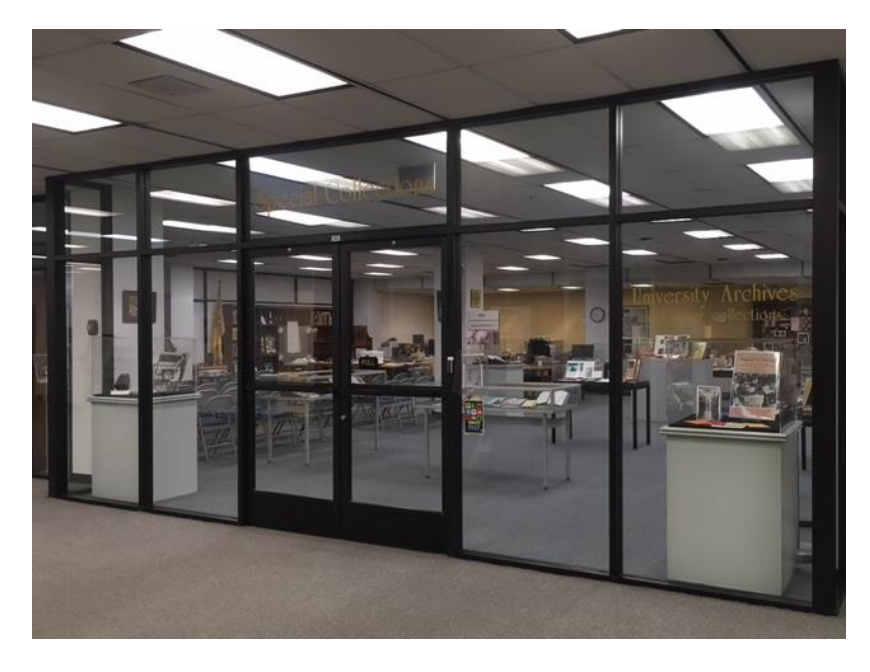
Special Collections and Archives Reading Room, 4^{\text{th}} floor of the University Library