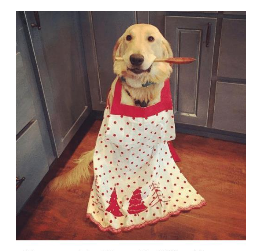
Excuse Me Mom But You'll Have To Get Out, There Are Just Too Many Cooks In The Kitchen